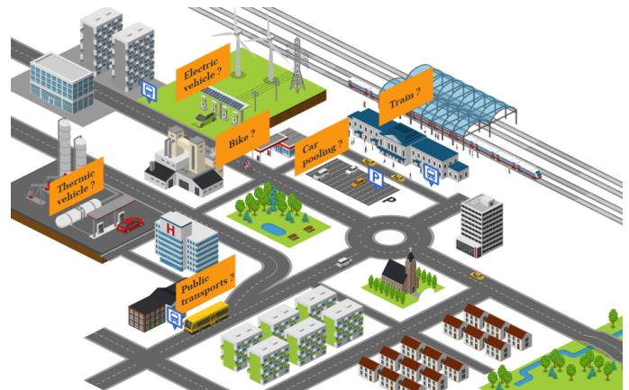
Figure 3. Demo sites

analyze and evaluate their traffic algorithms under real-world conditions. Thus, realistic simulation scenarios must be prepared and described [9].